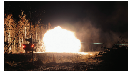
Soldiers test their physical endurance and perform basic Arctic warrior tasks such as an Ahkio sled pull (top). A Stryker Mobile Gun System fires a high explosive round at simulated targets during nighttime qualifying maneuvers (bottom).