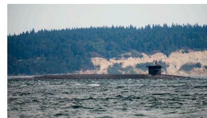
Guided-missile submarine USS Ohio prepares to moor NAVMAG Indian Island after completing a forward deployment (top). The Navy is seeking to protect undeveloped forested lands and reduce marine traffic within the Puget Sound (bottom).