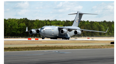
Airmen set up security measures at the Air Mobility Warfare Center (top). The first C-17 lands on a new Short Takeoff and Landing (STOL) runway protected by buffering (bottom).