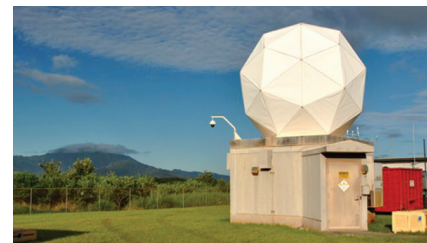
Nearby pineapple fields and other agricultural lands (top), provide a buffer for the Navy’s state-of-the-art Mobile User Objective System satellite dishes and narrowband tactical satellite communications system for improved ground communications for U.S. forces on the move (above).