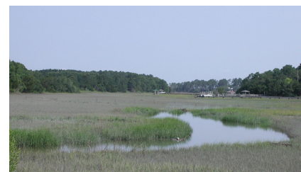
MCAS Beaufort hosts training on aircraft such as the F/A-18 Hornet (top). Preserved wetlands near the installation help to protect area water quality (bottom).