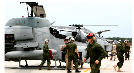
MCAS Cherry Point provides training on the SuperCobra attack helicopter (bottom) and bombing runs on nearby Piney Island (top).