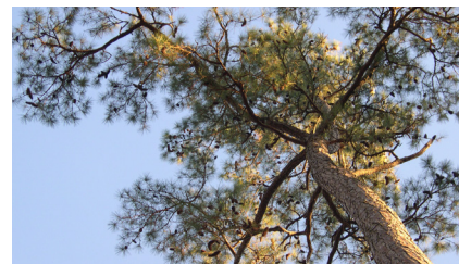
Amphibious training at MCB Camp Lejeune (top). Projects help preserve the longleaf pine ecosystem (bottom), which aids red-cockaded woodpecker recovery and sustainment.