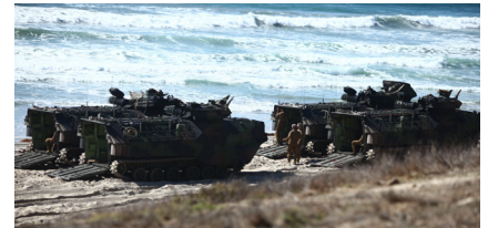
Coastal mountains provide habitat and training (top). Amphibious training at Camp Pendleton's beaches (bottom).