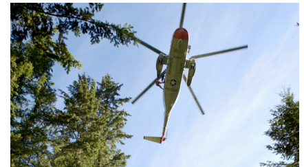
The EA-6B, which jams enemy radar, conducts maneuvers above NAS Whidbey Island (top). A Sea King helicopter conducting search and rescue exercises (bottom).