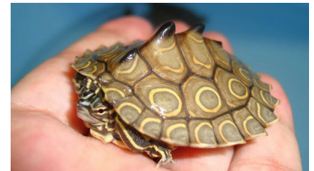
Members of Special Boat Team-22 and other Navy Special Forces and military units from other nations use the riverine training environment at the Stennis Western Maneuver Area (top). The surrounding habitat is also home to threatened species like the ringed map turtle (bottom).