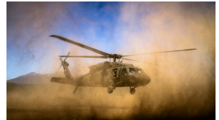
A night sky clear of smoke and lights allows Naval Observatory Flagstaff to conduct scientific observation and research for reference frames for celestial navigation and orientation (top). Protected lands in this area also supports buffers for training at Camp Navajo that causes noise and dust (bottom).