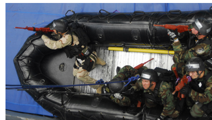
NSA Hampton Roads, Northwest Annex also conducts simulated visit, board, search and seizure training courses, which include rappelling and container search maneuvers (top) and non-compliant vessel boarding exercises (bottom).