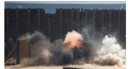
A technician practices a rope rescue exercise (top). Some research, development, test, and evaluation activities include detonating an improvised explosive device to develop better ways of combating them in the field (bottom).