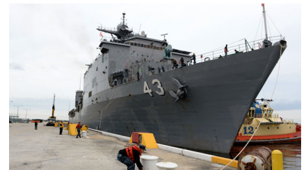
Sailors aboard the amphibious assault ship USS Iwo Jima (LHD 7) heave mooring lines during a sea-and-anchor detail at NS Mayport (top). USS Fort McHenry (LSD 43) docked at NS Mayport (bottom).