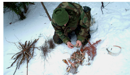
SERE School field training at the Redington property in Maine (top) provides sailors with basic survival skills like starting a fire in harsh, remote environs (bottom).