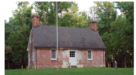
The isolated and pristine environments of NWS Yorktown and its associated Special Areas are perfect for Navy Special Forces training (top). Many surrounding lands have historical and cultural importance, similar to the Lee House on NWS Yorktown (bottom).