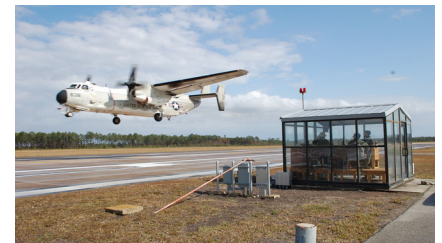
A historical 1944 aerial (top) of OLF Whitehouse demonstrates the numerous runways (bottom) that are a vital and unique asset today.