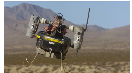
The weapons test ranges at the R-2508 Complex includes test of missiles (top), and other new technologies, including micro air vehicles (bottom).