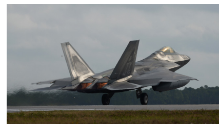
Tyndall AFB’s location and access to Gulf of Mexico operating areas allows aviators to utilize unique capabilities, such as realistic aerial target practice against unmanned QF-16 drone jets (top). An F-22 takes off from Tyndall AFB to use this capability and evaluate air-to-air weapons systems (bottom).