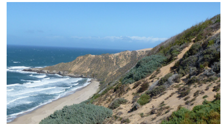
The Delta IV Heavy rocket stands 235 feet tall and is America’s most powerful liquid-fueled rocket (top). Point Sal Reserve area was preserved for use as a passive recreational center (bottom).