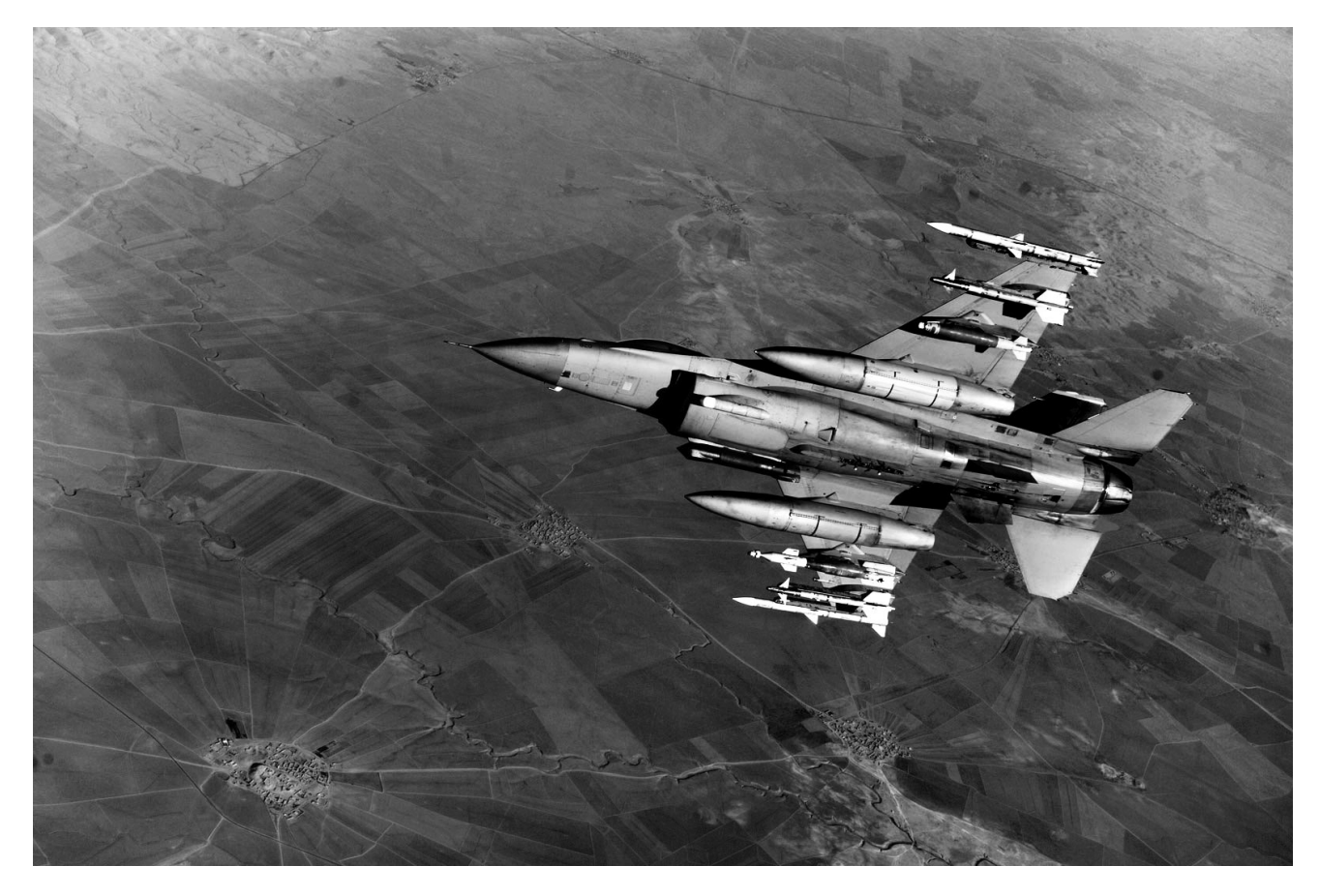
Falcon and Farmlandn