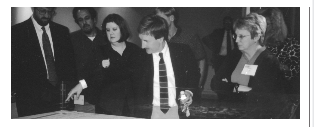
Community groups can assist installation management leaders in understanding community concerns and allow the installation direct access to key stakeholders.

Government officials include elected and appointed officials at the federal, state, regional, and local levels. These individuals frame laws, invest public funds, administer regulations, and make decisions on plans and projects while seeking to maintain their power bases and appointments.