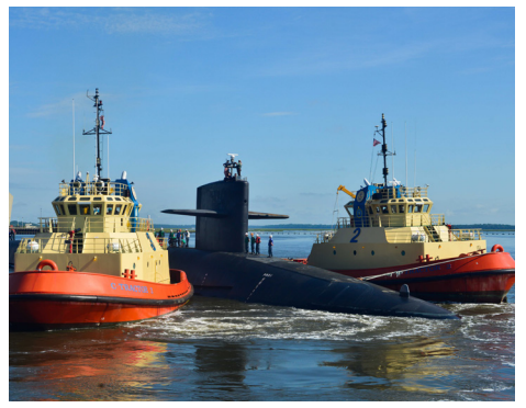
USS Tennessee departs Naval Submarine Base Kings Bay