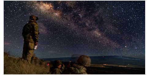
3. Pōhakuloa Training Area, Hawai'i Island REPI Funds: $1.3M