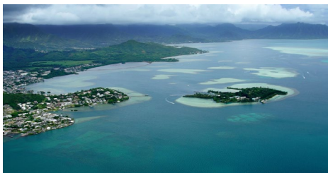
10. Pacific Missile Range Facility Barking Sands, Marine Corps Base Hawai'i, Pōhakuloa Training Area, Kaua'i, O'ahu, Hawai'i Island REPI Funds: $3.1M