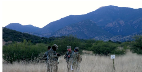
5. Fort Huachuca, Arizona REPI Funds: $1.3M