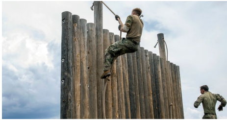
1. Naval Observatory Flagstaff Station & Camp Navajo, Arizona REPI Funds: $1.0M