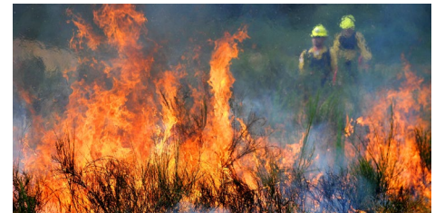
6. Joint Base Lewis-McChord, Washington REPI Funds: $2.4M