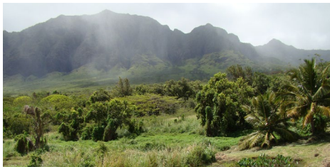
4. U.S. Army Garrison–Hawai'i: Makua Military Reservation, Schofield Barracks, Kahuku Training Area, Poamoho Training Area, O'ahu REPI Funds: $2.7M