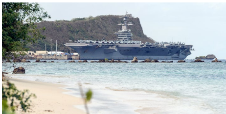
8. Joint Region Marianas: Naval Base Guam, Marine Corps Base Camp Blaz, Andersen Air Force Base, Guam REPI Funds: $1.9M