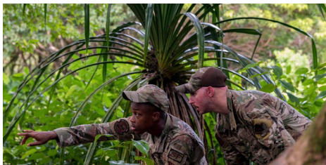
7. Joint Region Marianas: Marine Corps Base Camp Blaz, Andersen Air Force Base, Guam REPI Funds: $1.2M