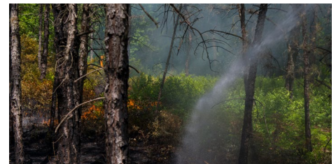
9. Joint Base McGuire-Dix-Lakehurst, Warren Grove Range, Naval Weapons Station Earle, Sea Girt National Guard Training Facility, AEGIS Combat System Engineering Site, New Jersey REPI Funds: $995K