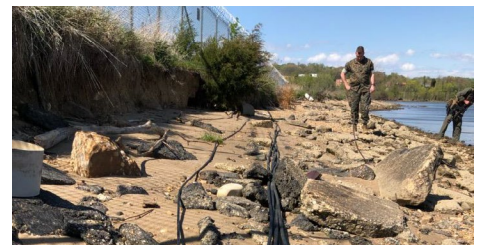
12. Marine Corps Base Quantico, Virginia REPI Funds: $286K