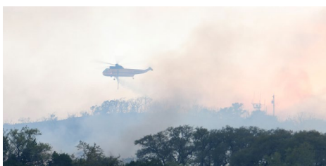
13. Joint Base San Antonio Camp Bullis, Texas REPI Funds: $5.1M