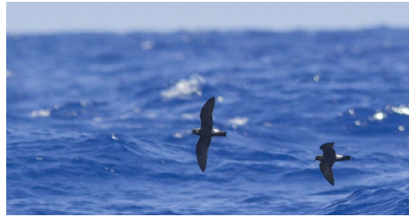
2. U.S. Army Garrison–Hawai'i, Pacific Missile Range Facility Barking Sands, Marine Corps Base Hawai'i, O'ahu, Kaua'i & Hawai'i Island REPI Funds: $2.9M