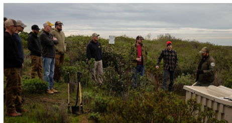
11. Marine Corps Base Camp Pendleton, Naval Base Coronado, Naval Base Ventura County Point Mugu, Naval Weapons Station Seal Beach, California REPI Funds: $75K