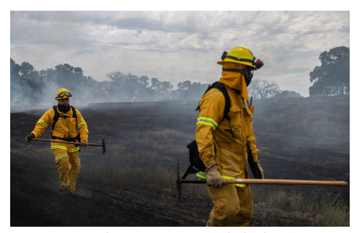
Airmen observe a wildfire at Beale Air Force Base, Calif. (U.S. Air Force photo by Airman Jason W. Cochran).