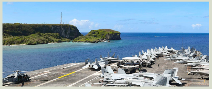
Nimitz-class aircraft carrier USS Abraham Lincoln (CVN 72) gets underway from Naval Base Guam following a port visit. (U.S Navy Photo by Mass Communication Specialist Seaman Apprentice Julia Brockman).