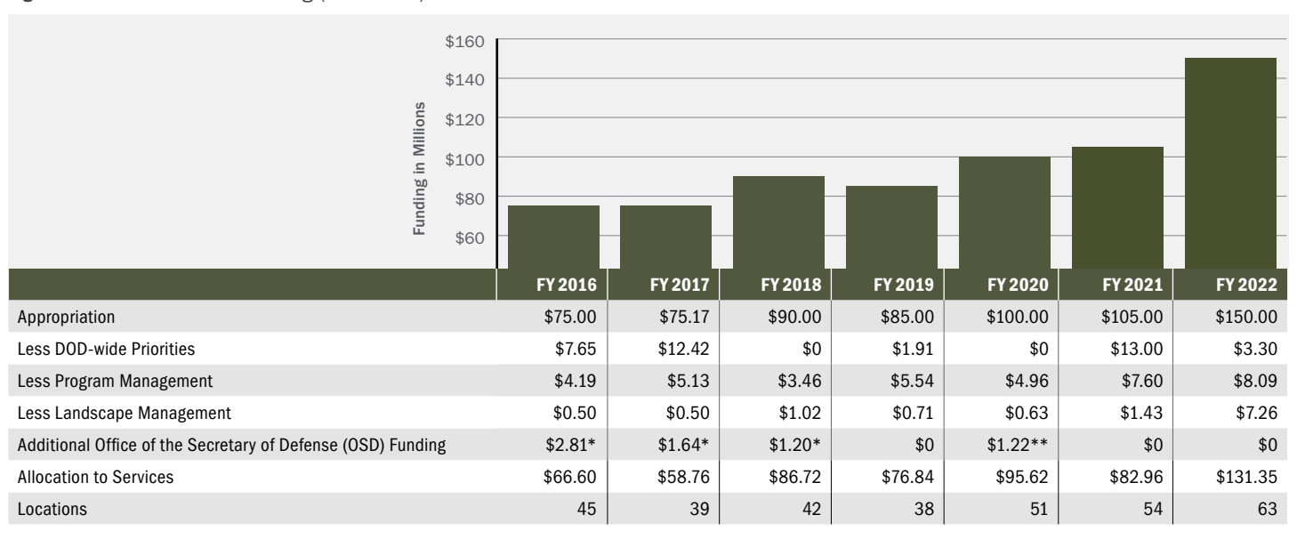
Figure 2: REPI Fiscal Year Funding (in millions)

Select Service totals reported in Figure 1 may vary slightly from Service totals reported in Figures 7 through 10 because of consolidation due to Joint Basing.