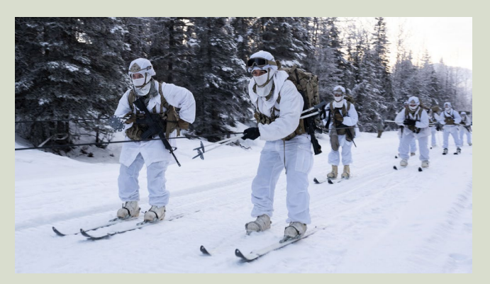
Army paratroopers assigned to Headquarters and Headquarters Company, 1st Battalion, 501st Parachute Infantry Regiment, 4th Infantry Brigade Combat Team (Airborne), 25th Infantry Division, U.S. Army Alaska, hold onto a rope secured to the back of Small Unit Sustainment Vehicle during a skijoring exercise at Joint Base Elmendorf-Richardson, Alaska.

Figure 5 shows that the REPI Program has committed or expended over $13.6 million under the Sikes Act and IGSA authority. As of FY 2022, DOD has invested $8.7 million of this amount into interest-bearing accounts under the Sikes Act for the long-term management of natural resources beyond installation boundaries to benefit the military mission.