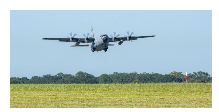
A WC-130J Super Hercules aircraft assigned to the 53rd Weather Reconnaissance Squadron departs Keesler Air Force Base, Miss.

The REPI Program investments in the NCRF and America the Beautiful Challenge since FY 2020 may be found below in Figure 4.