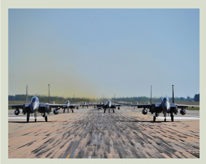
U.S. Air Force F-15E Strike Eagle figher aircraft of the 4th Fighter Wing perform an "Elephant Walk" as they taxi down the runway during a Turkey Shoot training mission on Seymour Johnson Air Force Base, N.C. (U.S. Air Force photo by Staff Sgt. Elizabeth Rissmiller).

Installation facilities, personnel, and missions continue to face mounting risks from climate change threats such as wildfires, coastal flooding, drought, land degradation, and thawing permafrost. The Military Departments are leveraging the REPI Program to advance nature-based solutions that increase the installation and surrounding community's resilience to a changing climate.