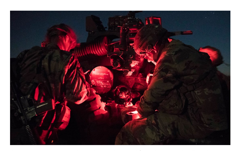
Army paratroopers conduct a heavy drop and fire mission during Exercise Panther Storm on the Salerno Drop Zone at Fort Bragg, N.C.