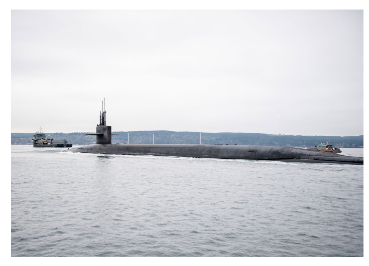
The Ohio-class ballistic missile submarine USS Kentucky (SSBN 737) transits the Hood Canal as the boat returns to its homeport of Naval Base Kitsap-Bangor, Washington.

Flagstaff Station and Camp Navajo, Arizona; Beale AFB, California; PMRF Barking Sands, Hawai'i; JBPHH, Hawai'i; Pōhakuloa Training Area, Hawai'i; Naval Air Station (NAS) Patuxent River, Maryland; Fort Bragg (Future Fort Liberty), Seymour Johnson AFB, Marine Corps Base (MCB) Camp Lejeune, Marine Corps Air Station Cherry Point, North Carolina; Naval Base Kitsap, Washington.