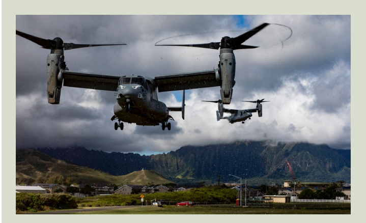
MV-22B Ospreys attached to Marine Medium Tiltrotor Squadron 163, 11th Marine Expeditionary Unit, land at Landing Zone Eagle aboard Marine Corps Base Hawai'i.

For the fourth consecutive year, the REPI Program will publish a metrics report to quantify the REPI Program's value to the Department's strategic priorities. The FY 2022 Metrics Report will summarize more than 17 years of REPI Program data on the Military Services' growing encroachment threats and military missions protected by REPI projects.