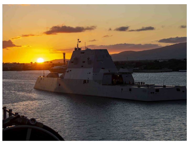
Zumwalt-class guided-missile destroyer USS Michael Monsoor (DDG 1001) gets underway in Joint Base Pearl Harbor-Hickam.