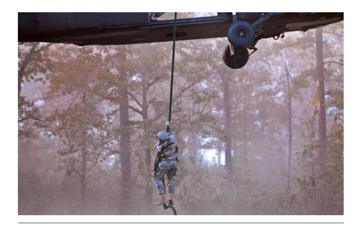
A soldier fast ropes into an urban scenario from a UH-60 Black Hawk helicopter during phase two of the Reconnaissance Surveillance Leaders Course at Fort Benning, Georgia.

The Department continues to engage and educate key stakeholders, such as the National Conference of State Legislatures, about the National Defense Strategy's military mission requirements and the effects of encroachment. The REPI program's outreach efforts, in conjunction with the Department's Office of Economic Adjustment community planning programs, offer cost-effective tools that enable partner organizations and communities to identify and adopt beneficial land use policies and practices that support military needs. Engaging in local planning forums, educating communities on the military's operational footprint, formalizing local community development action notifications to the military, guiding compatible community development through transfer and purchase of development rights, and restoring and preserving open space via conservation easements all increase opportunities to coordinate and ensure that regional development is compatible with military readiness requirements. The Sentinel