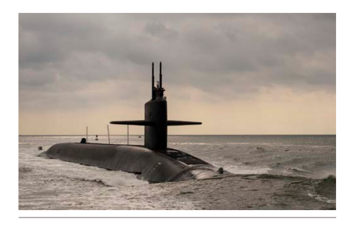
The Ohio-class ballistic missile submarine USS Maryland (SSBN 738), which is based out of Naval Submarine Base Kings Bay in Georgia, transits the Saint Mary's River.

As the Department invests in modernizing capabilities and maintaining its innovative edge, it must also explore new ways to design and finance projects to mitigate evolving encroachment threats. Changes in force structure and technology combined with a limited amount of available airspace and land resources means protecting existing installation and range assets and capabilities is more important than ever.