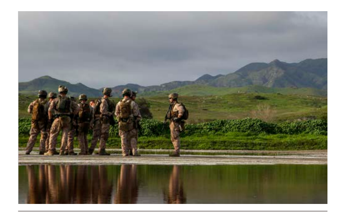
Marines with the 15th Marine Expeditionary Unit Maritime Raid Force discuss their individual movements during a Marine Expeditionary Unit Exercise at Camp Pendleton, California.

support realistic training conditions, mitigate risks against wildfires through the use of controlled burns, and recover threatened and endangered species to ease regulatory restrictions on mission capabilities.