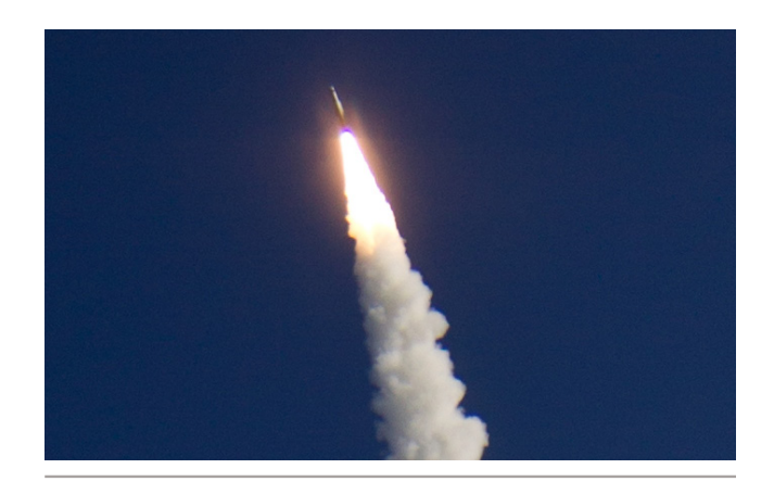
A Standard Missile-3 (SM-3) Block 1B interceptor missile is launched from the guided-missile cruiser USS Lake Erie (CG 70) during a Missile Defense Agency and U.S. Navy test. The SM-3 Block 1B successfully intercepted a target missile that had been launched from the Pacific Missile Range Facility at Barking Sands in Kauai, Hawaii.

Landscapes Partnership, operated in conjunction with DOI and USDA, exemplifies these advanced efforts and will continue to be an innovative tool in the face of constantly changing encroachment pressures.