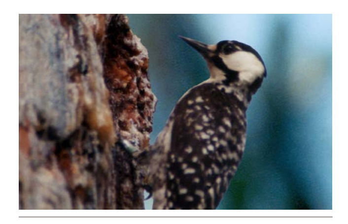
Red-cockaded woodpeckers are protected on multiple Army installations in the southeastern United States.

The REPI program also continues to participate in the National Fish and Wildlife Foundation's Longleaf Stewardship Fund, which aggregates public and private funds to protect and restore longleaf pine and relieve test and training restrictions for multiple installations in the Southeast. In 2019, the Stewardship Fund protected the missions of nine military installations, including: Camp Blanding, Eglin AFB, and Tyndall AFB in Florida; Fort Benning and Fort Stewart in Georgia; Fort Polk in Louisiana; Camp Shelby in Mississippi; and Fort Bragg and Military Ocean Terminal Sunny Point in North Carolina. Projects awarded through the 2019 grants will protect compatible lands adjacent to essential training and testing activities, preserve natural environments that