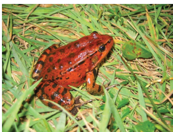
An aerial view of Camp San Luis Obispo from 1984 (left). Today, Camp San Luis Obispo provides important habitat for the threatened California red-legged frog (right).