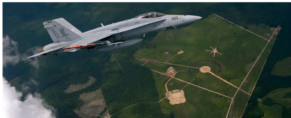
A vital air-to-ground range used by the Marine Corps and the other three Military Services, Townsend Bombing Range is supports the use of precision-guided weapons and other advanced weaponry in training.

For all REPI Project Profiles visit: www.repi.mil/BufferProjects/ProjectList.aspx