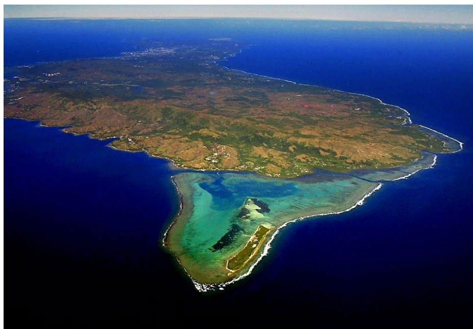
The Island of Guam, courtesy of U.S. Marine Corps Base Camp Blaz.

For all REPI Project Profiles visit: www.repi.mil/BufferProjects/ProjectList.aspx