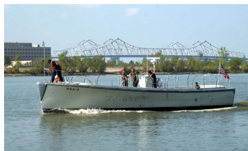
Facilities at Naval Air Station Joint Reserve Base New Orleans provide the Navy with a diverse array of training venues (left and top).