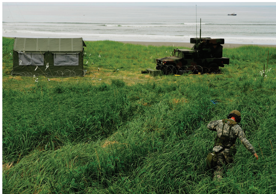
Camp Rilea's diverse geographies include training along the Oregon coastline.

For all REPI Project Profiles visit: www.repi.mil/BufferProjects/ProjectList.aspx