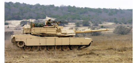
Fort Cavazos's training lands support intensive and varied training requirements, such as a convoy training exercise containing a road block scenario (top). Buffers help protect against noise conflicts from live-fire exercises with the M1A2 Abrams tank (bottom).