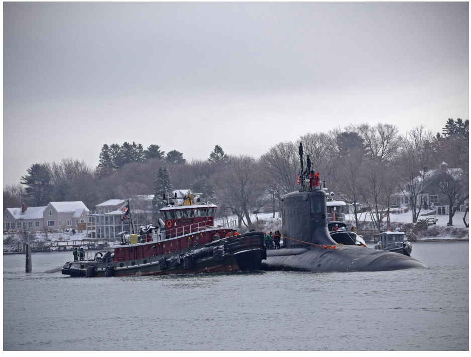
USS New Hampshire arriving at NSY Portsmouth for scheduled maintenance.

For all REPI Project Profiles visit: www.repi.mil/BufferProjects/ProjectList.aspx