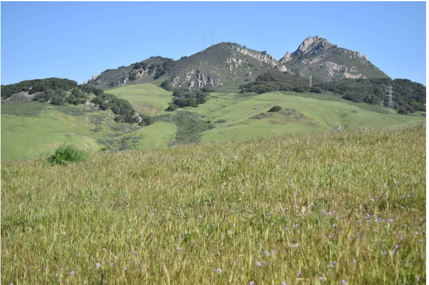
Newly preserved land in the Los Osos Valley included 540 acres around Hollister Peak.