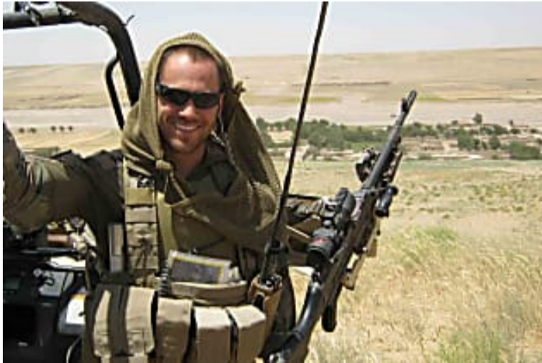
Charges reinstated against Navy Corpsman in case of Green Beret contractor killed in Iraq Task & Purpose