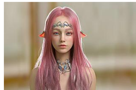
A Game Where Everything Is Allowed! Sponsored | RAID: Shadow Legends