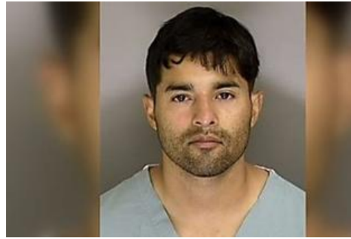
Former Air Force sergeant sentenced to life for killing a cop in the name of... Task & Purpose