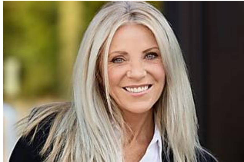
7 of the Worst Retirement Mistakes You Can Make Sponsored | SmartAsset