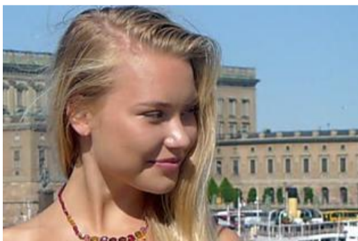
30 American Stereotypes Foreigners Can't Stand Sponsored | Auto Overload