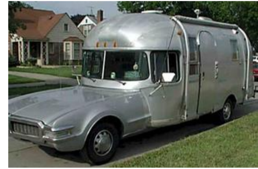
30 Of The World's Most Bizarre Motorhomes Sponsored | Yeah Motor!