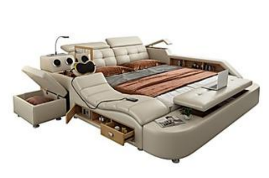
Unsold Smart Beds Have Never Been So Cheap Sponsored | Smart Bed | Search Ads