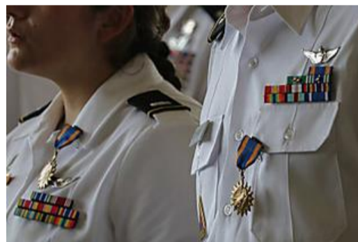
The 82nd Airborne awarded soldiers for the Kabul evacuation, then took the medals back for now Task & Purpose