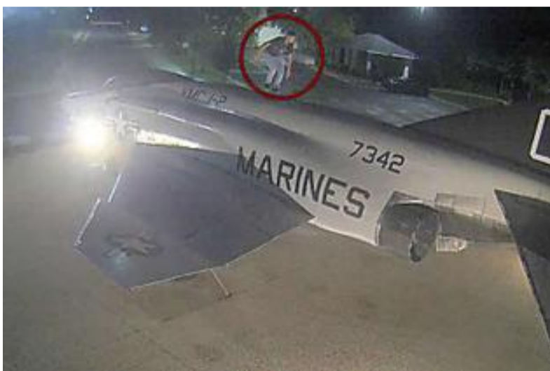
2 Marines skip out on Waffle House check, vandalize aircraft, get arrested Task & Purpose