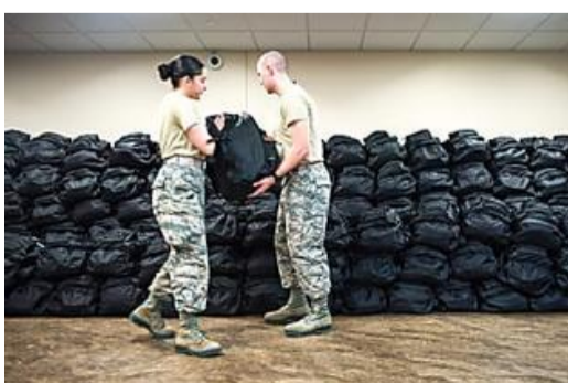
The best survival backpacks for overcoming unexpected emergencies Task & Purpose