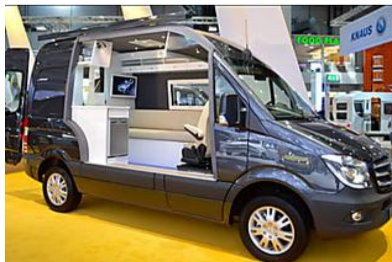
Most Affordable Camper Vans Sponsored | Camper Vans Warehouse