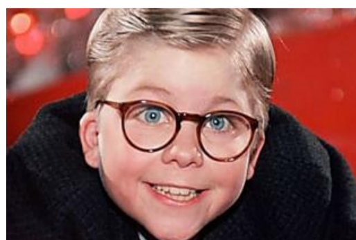
Quiz: Can You Guess The Movie From A Single Scene? Sponsored | The Grizzled