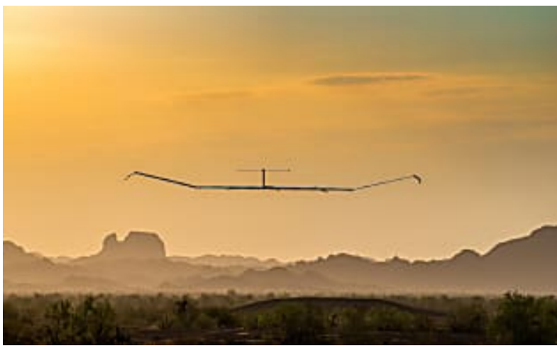
After 64 days, the Army's drone that wouldn't die has died [Updated] Task & Purpose