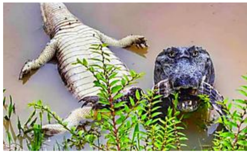
[Pics] This Image Proves How Scary Mother Nature Is Sponsored | History Daily