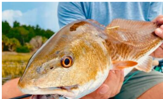
Ga DNR Coastal Resources Division Hosting Red Drum Town Halls in Savannah and Brunswick