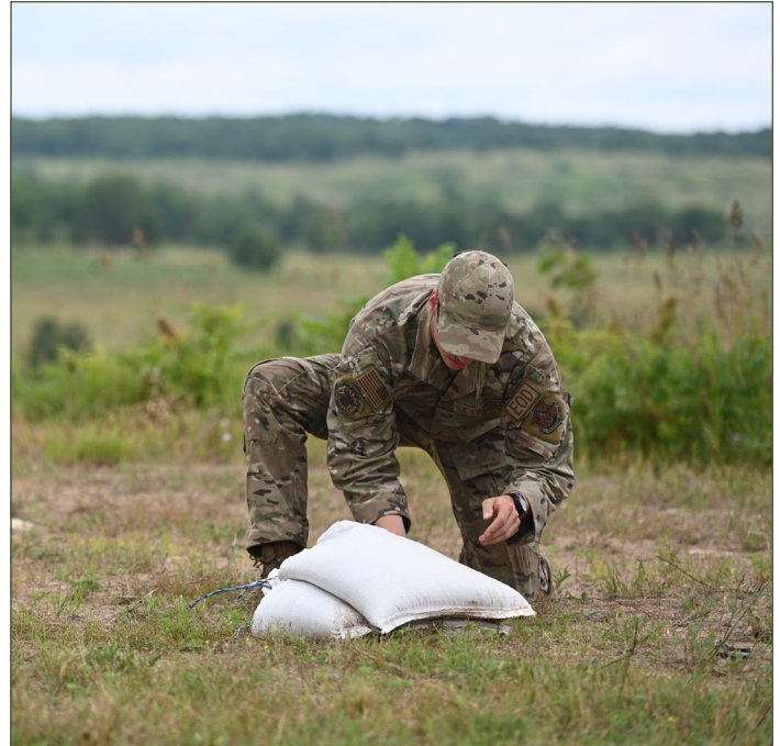
Members of the 148 th Fighter Wing Explosive Ordnance Disposal, Minnesota Air National Guard perform Render Safe Procedure Operations at Camp Ripley, Minnesota July 23, 2024.

This year, the National Park Service will award over $7.4 million from the LWCF to five projects across five states and territories. To this $7.4 million, the REPI Program is contributing $6.8 million as match in a combination of Fiscal Year (FY) 2024 and FY 2025 funds.