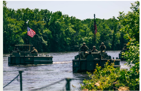
1437 th Engineer Multi-Role Bridge Company out of the Michigan National Guard conducts bridging operations across the Mississippi River at Camp Ripley Training Center in Little Falls, Minnesota.