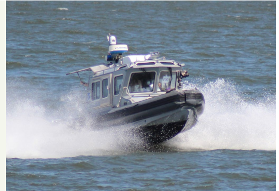
Harbor Security Boat teams assigned to Naval Weapons Station Yorktown conducted security exercises on the York River in the vicinity of the installation's R-3 weapons pier.