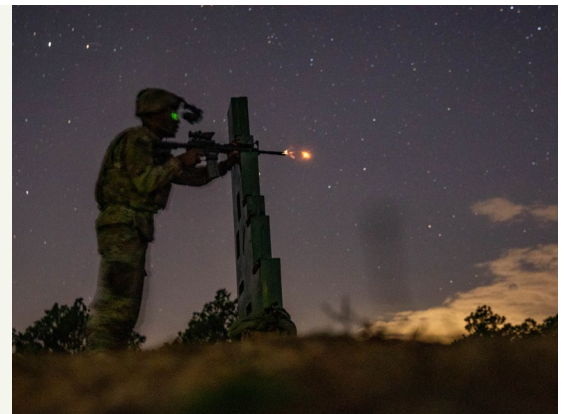
A soldier fires a rifle during a night M4 qualification at Fort Liberty, N.C. The training keeps soldiers proficient in marksmanship.